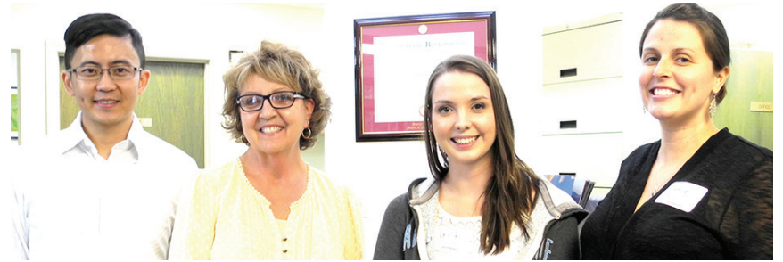
Complete Dentistry staff

The Chamber would like to thank Complete Dentistry for hosting a great Business After Hours and for their support of the Chamber. If you want to learn more about Complete Dentistry's services call 207-645-4994.