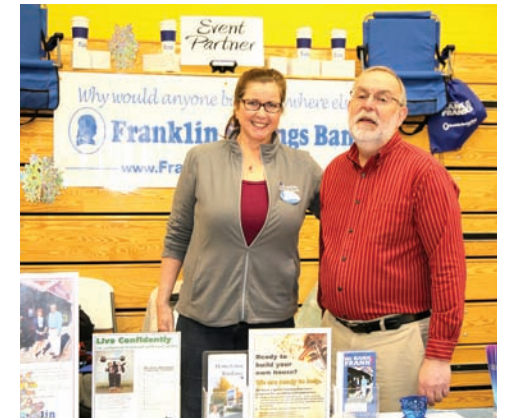
Franklin Savings Bank display at the Home & Leisure Show.