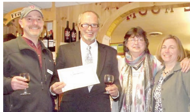
The certificate given to the owners of Ron's Market for their 10-year business anniversary.