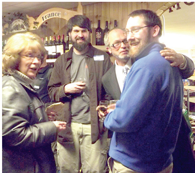
Wine tasting and networking at March's BAH.

Business After Hours events are excellent opportunities to network outside of the office setting. Anyone is welcome to attend, so join us and bring a friend or co-worker.