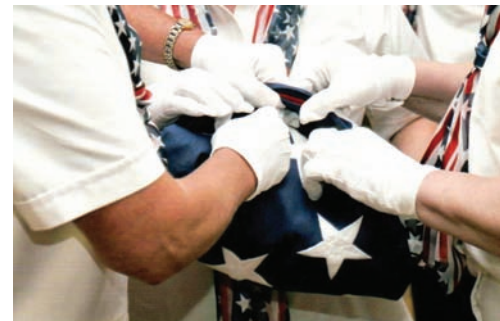
Flag folding by members of the Farmington Emblem Club #460.

The Farmington Emblem Club #460 is a group of members who support community charities, enjoy helping veterans and have a dedication to patriotism. The members are always ready to do a flag folding whenever asked. They give out scholarships to three schools yearly and support all the area food pantries. At Thanksgiving time they ask all the nursing homes and assisted living homes to bring their clients for dinner and music.