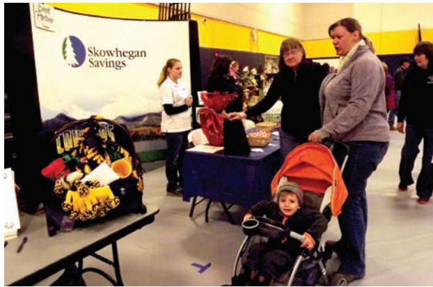
Attendees visiting the Skowhegan Savings Bank booth.

The Chamber thanks the many volunteers who donated their time to organize and facilitate the event. Also, we would like to thank the event sponsors who helped to make this a great event including: Franklin Savings Bank, Hammond Lumber, Dead River Company, Walmart and Skowhegan Savings Bank.