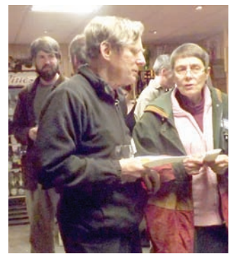
Socializing at the Business After Hours held at Ron's Market.