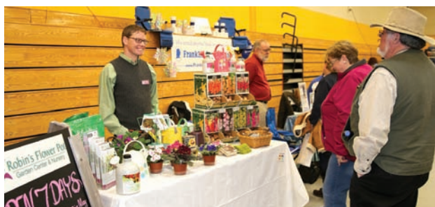
Robin's Flower Pot displayed spring flowers at the show.