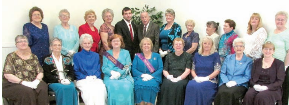
Emblem Club #460 officers for 2015-2016

If you know of a person deserving recognition, please submit the nominee's name and a description of their accomplishment to info@franklincountymaine.org or call the Chamber office at 207-778-4215.